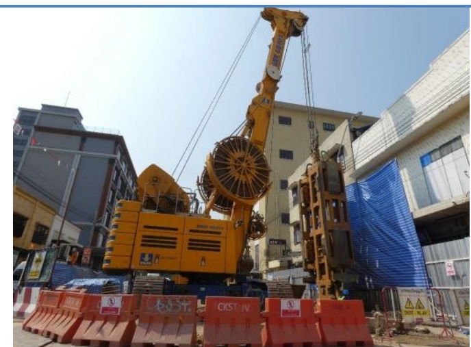
Figure 4: Underground section of the Purple-Line MRT extension route (6-7% of construction progress as of Mar 2023)