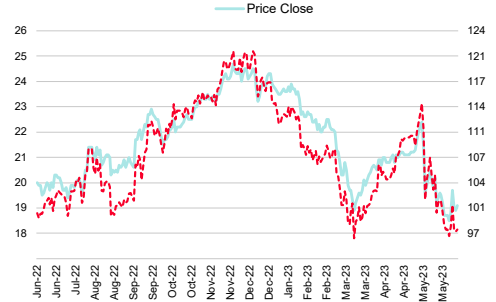
CH Karnchang (CK TB)