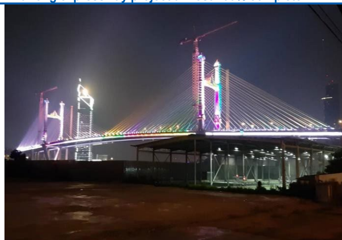
Figure 2: Bridge over Chao Phraya river within Rama III-Dao Khanong expressway project almost 100% complete